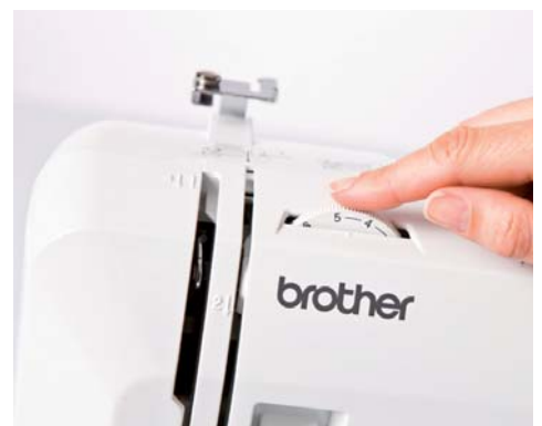
Stitch tension adjustment

For more informations see your dealer or visit www.brothersewing.eu .