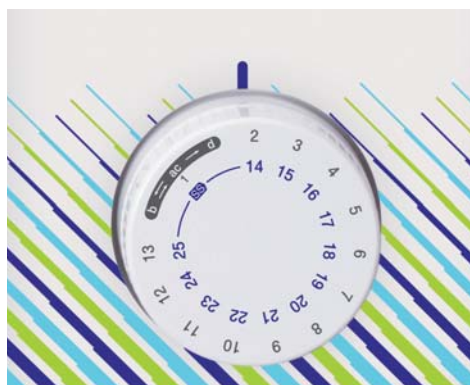
Easy stitch selection dial