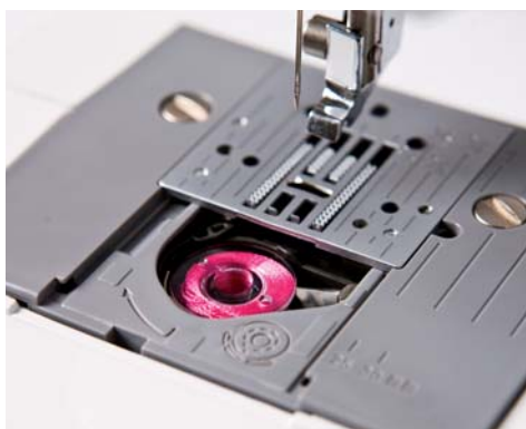
Top load drop in bobbin